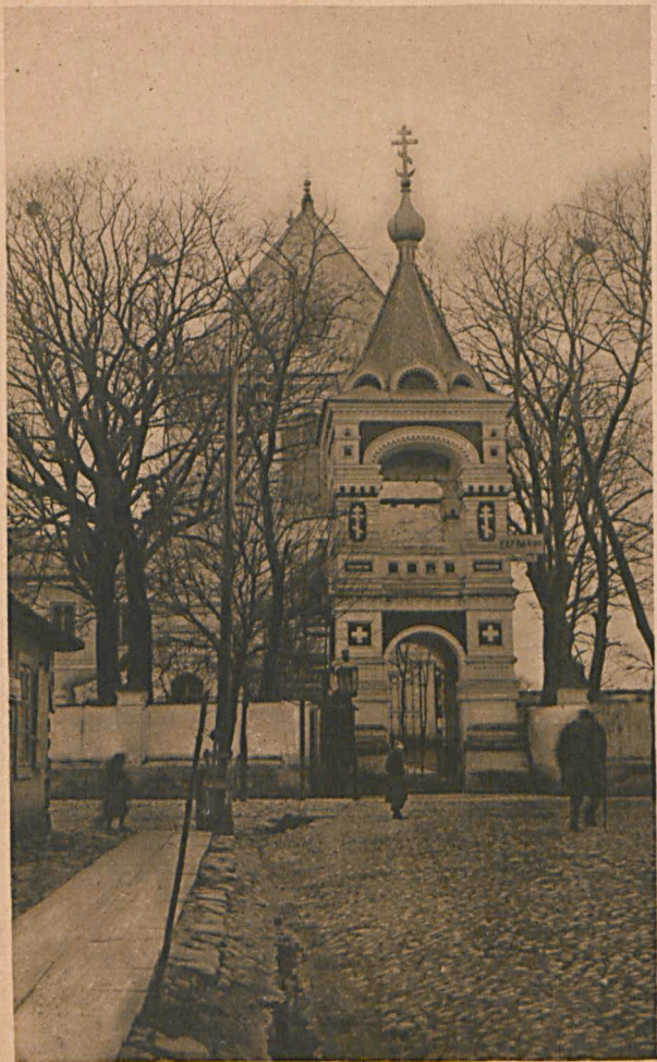
Blaia Russische Klosterkirche.