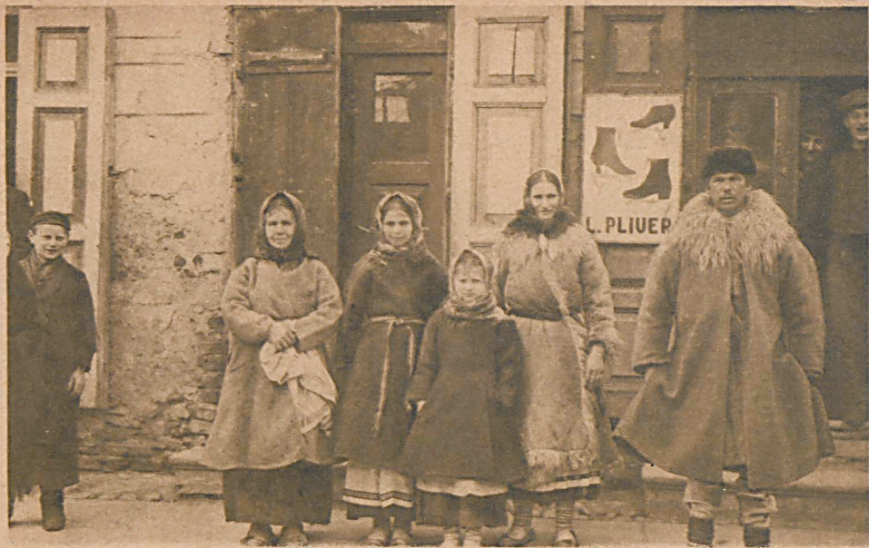
Biala Polen vom Lande.