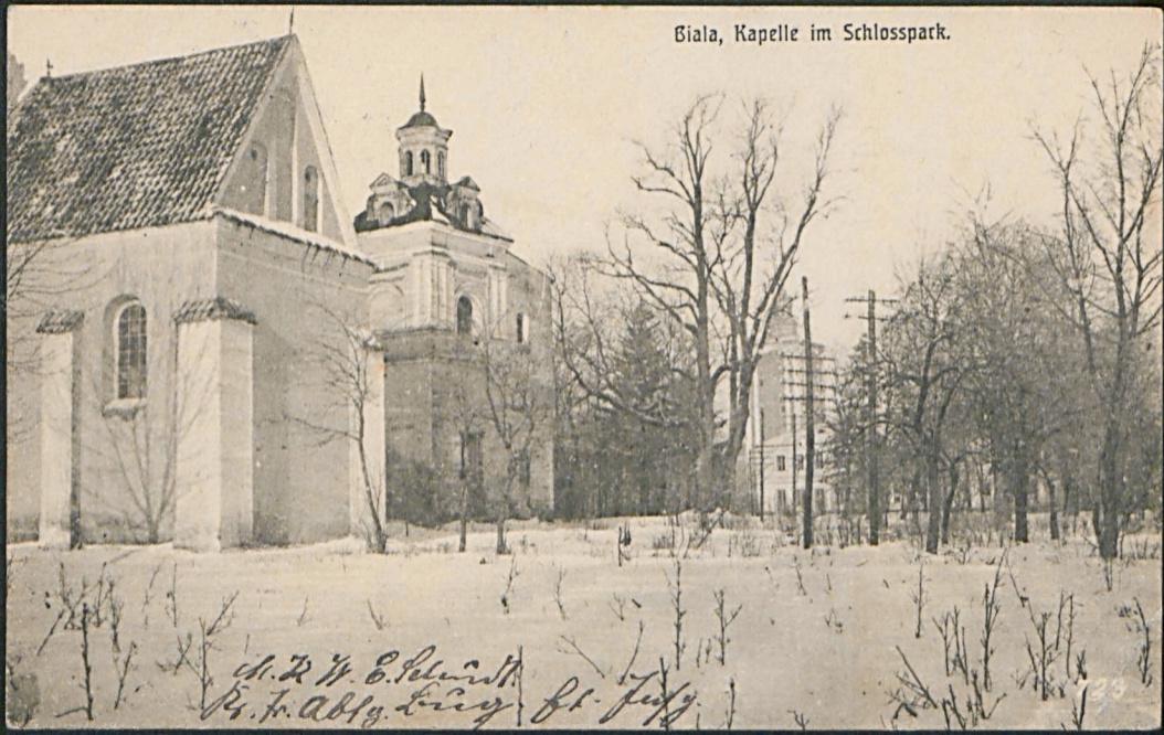
Biala, Kapelle im Schlosspark.